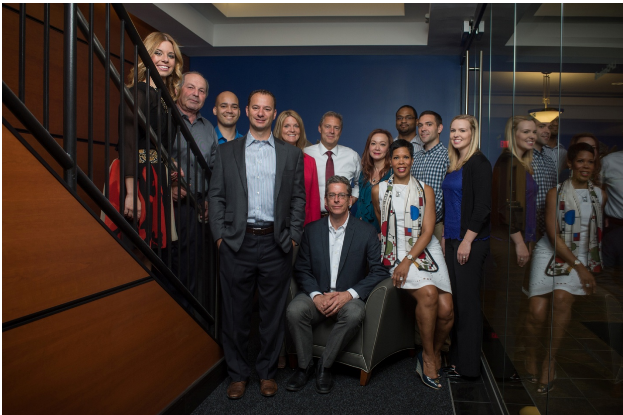
The staff at LPCiminelli